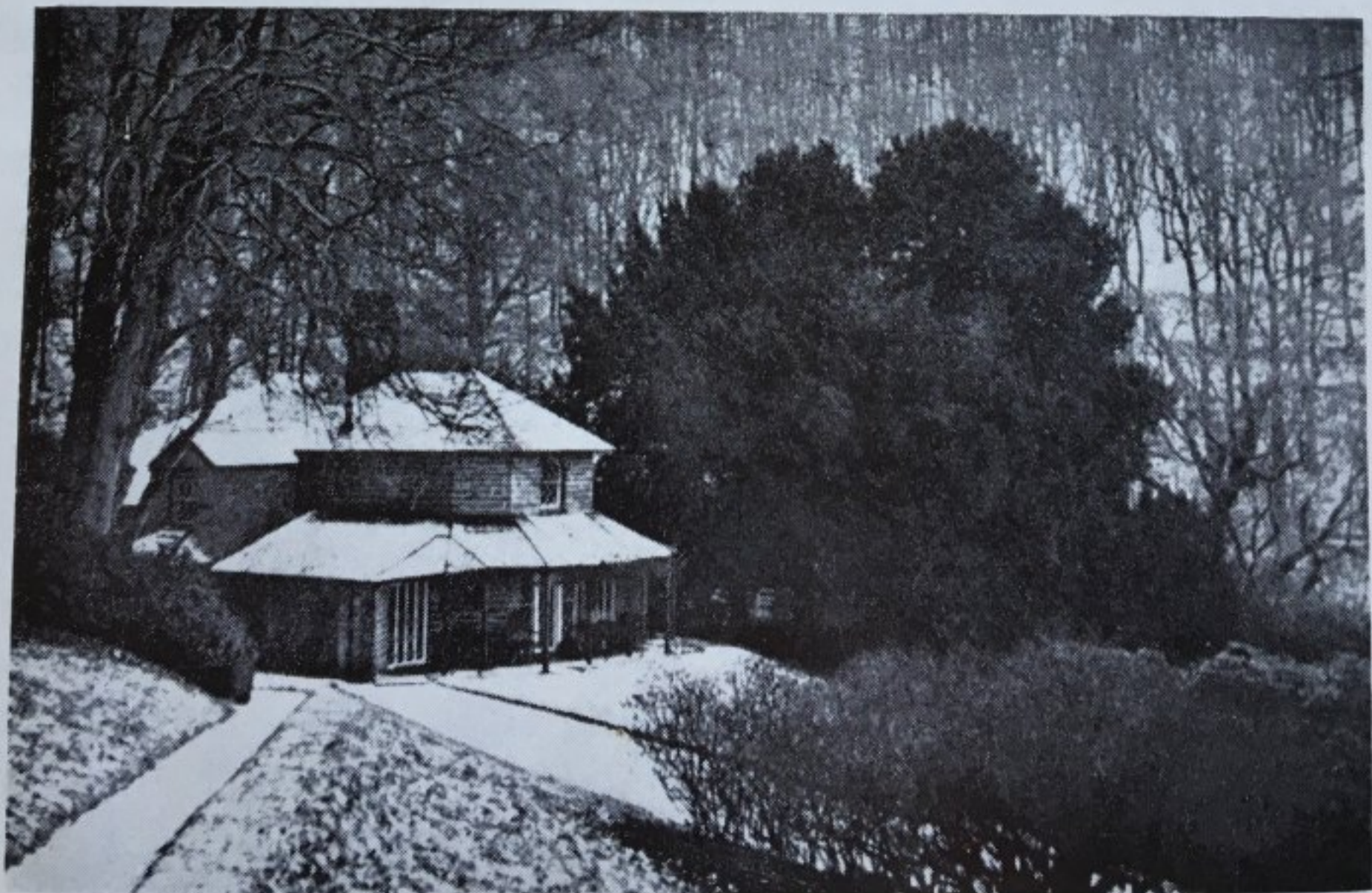
Pantlludw in the snow