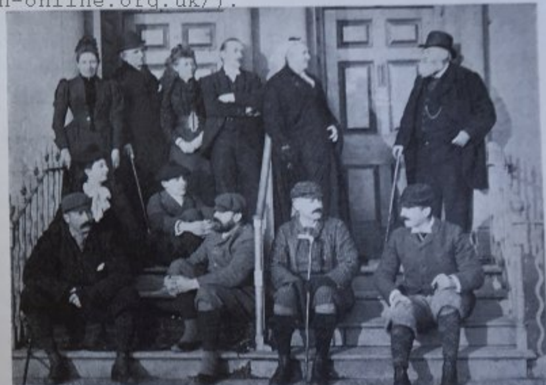
A Ruck family group at Aberdovey