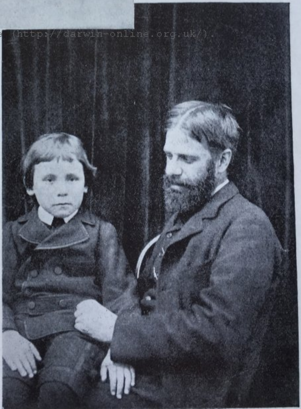
With Uncle Horace

Darwin Online ( http://darwin-online.org.uk/ )