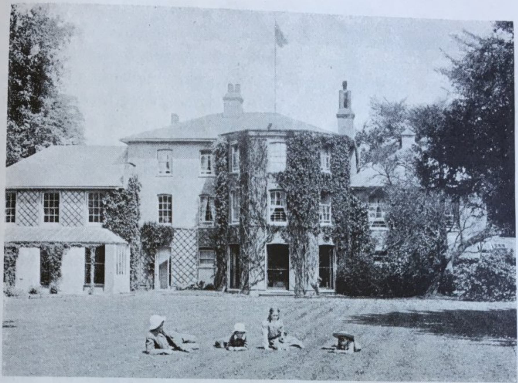
Darwin Online ( http://www.darwinonline.org.uk/ ). Down House, 1903