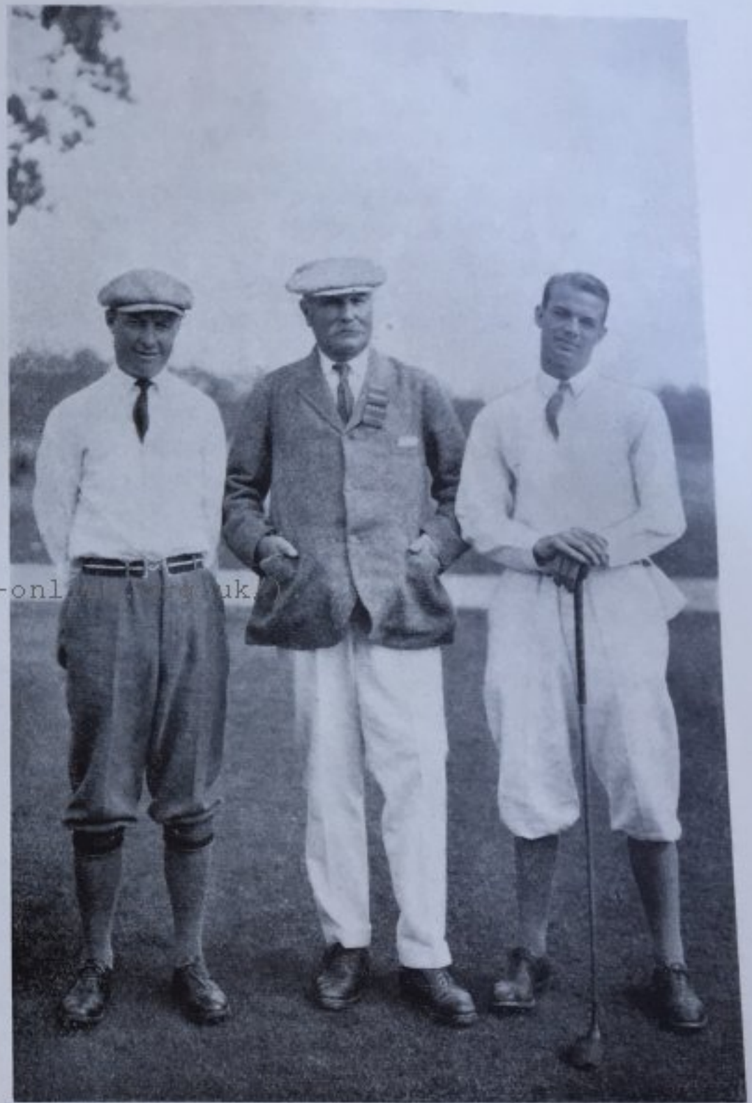
Chick Evans, C. B. Macdonald, Jess Sweetser