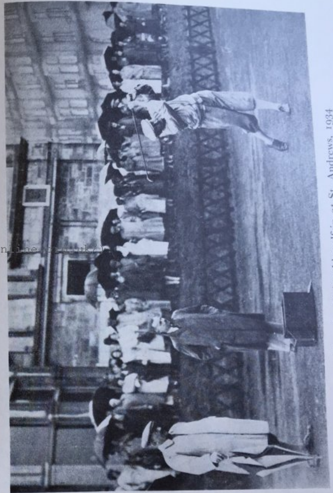
The Captain driving himself in at St. Andrews, 1934

At any rate there is now no doubt at all about the last