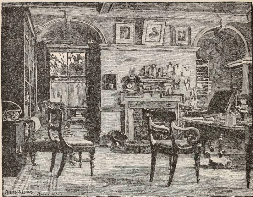
THE STUDY AT DOWN.*