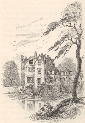
BREADSALL PRIORY, WHERE ERASMUS DARWIN DIED.